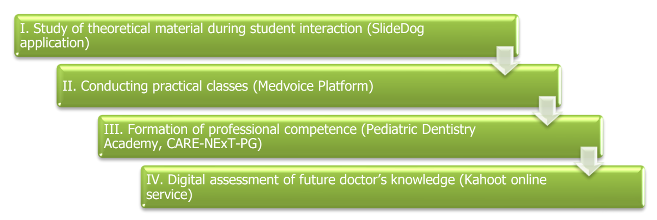
Figure 2. Approaches to the development of prospective doctors' communicative competence based on the use of digital technologies

Focusing on the established advantages of the future doctors' communicative competence development, the authors identified specific approaches to ensure the students' relevant training. The elaborated learning approaches involved the use of digital technologies as follows (Figure 2).